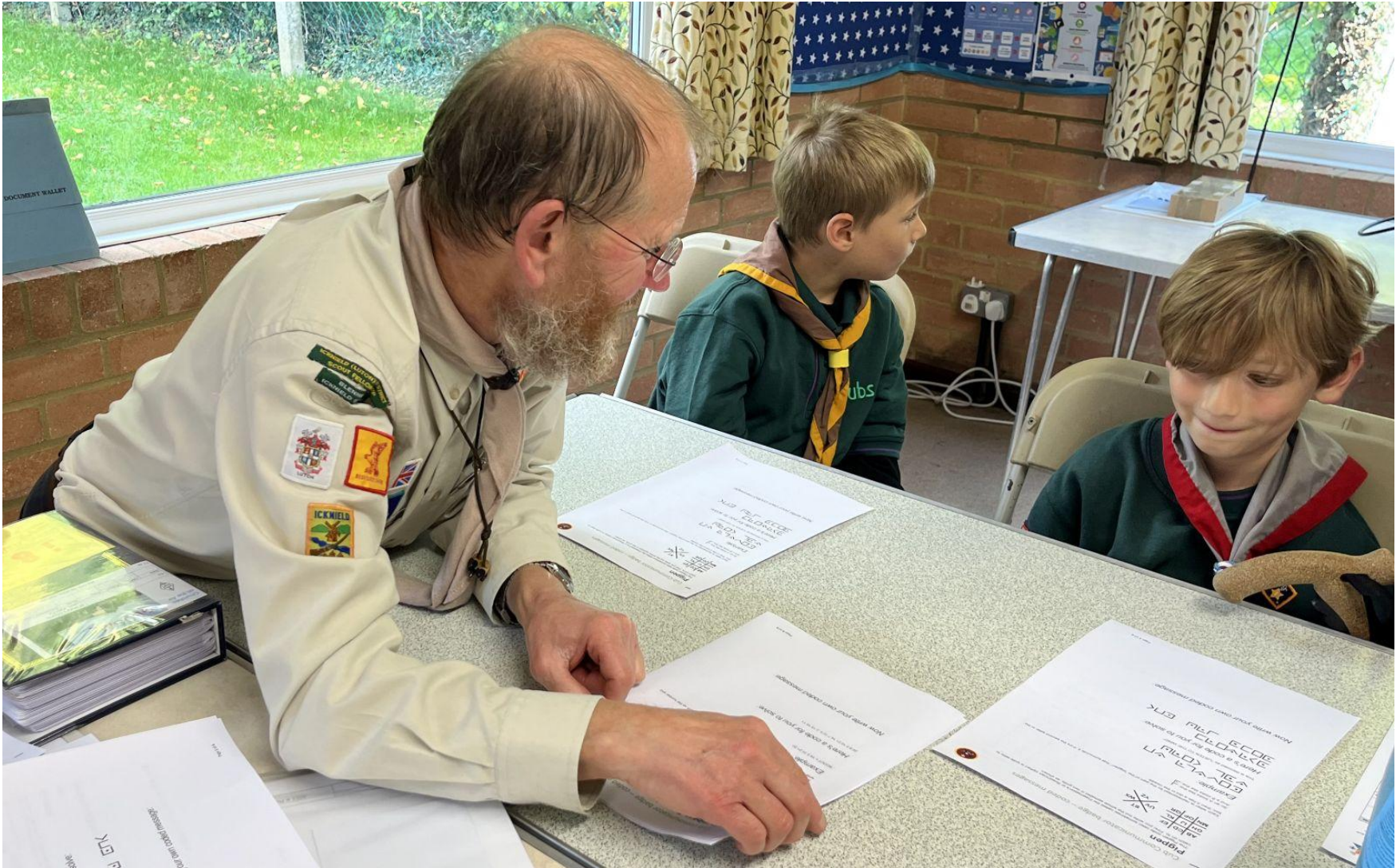
Coded messages Beaver Communicator badge sections 4 and 5 Cub Communicator badge section 5a