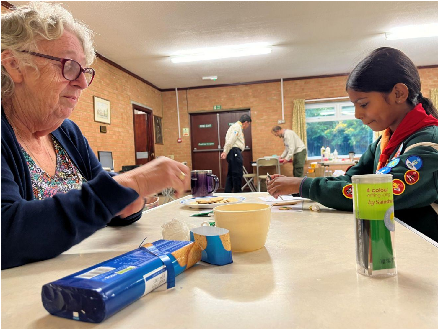
Spell your name in Morse Code using icing on a biscuit Beaver Communicator badge 4