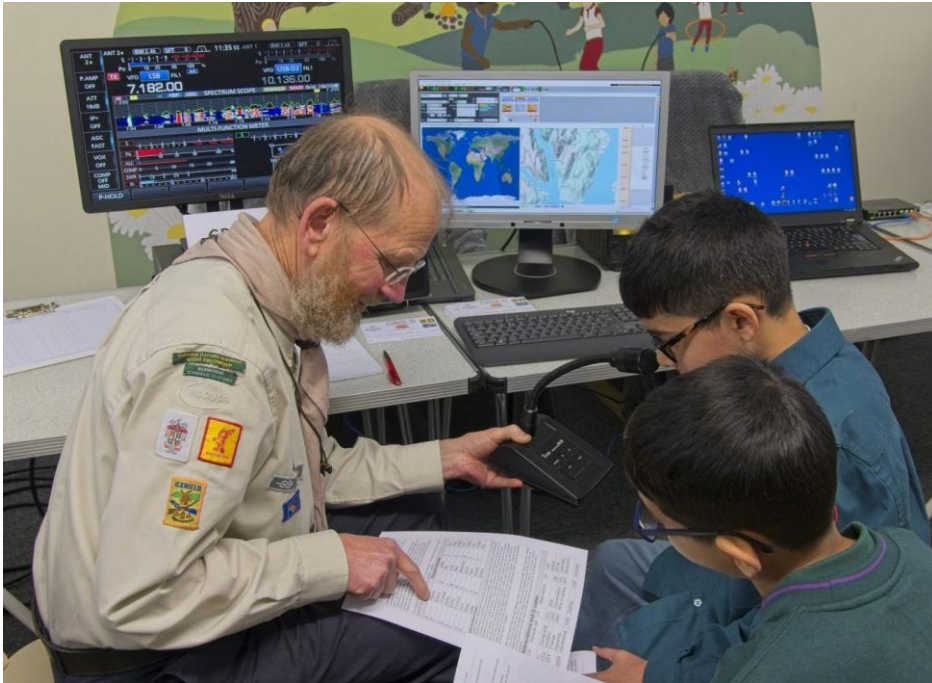
Sending a greetings message to another Jamboree on the Air radio station