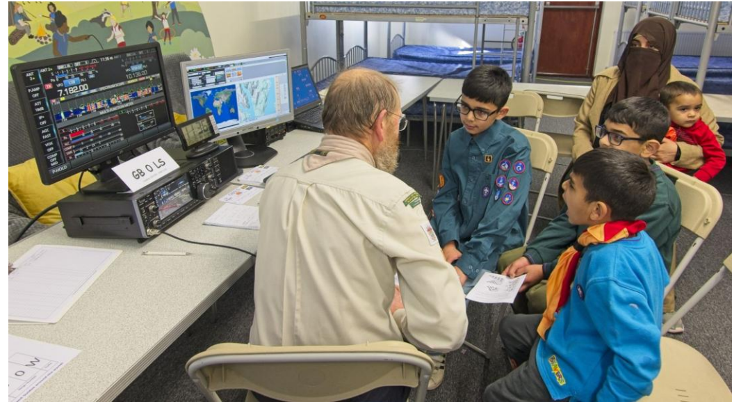
Phonetic alphabet Q Codes